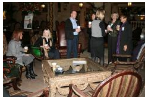
EWI Members and guests 'Connecting' over coffee!