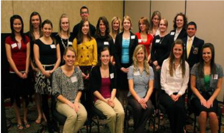
The 2010 EWI Scholarship Candidates