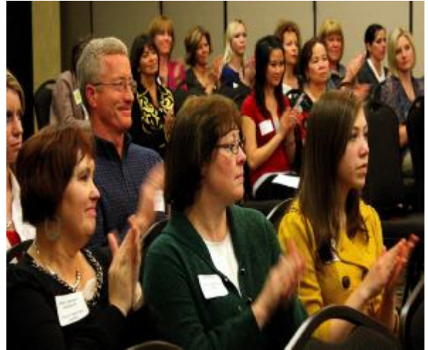
EWI Scholarship Banquet: Proud parents, Scholarship Candidates and EWI Members listen to speeches